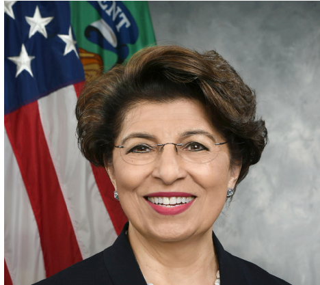
U.S. Small Business Administration Administrator, Jovita Carranza

U.S. Small Business Administration Administrator Jovita Carranza announced changes to help borrowers still paying back SBA loans from previous disasters. By making this change, deferments through December 31, 2020, will be automatic. Now, borrowers of home and business disaster loans do not have to contact SBA to request deferment.